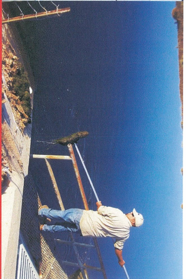
Rakes made from aluminum to clean the grates to the District's pumping plants forebays along the California Aquaduct