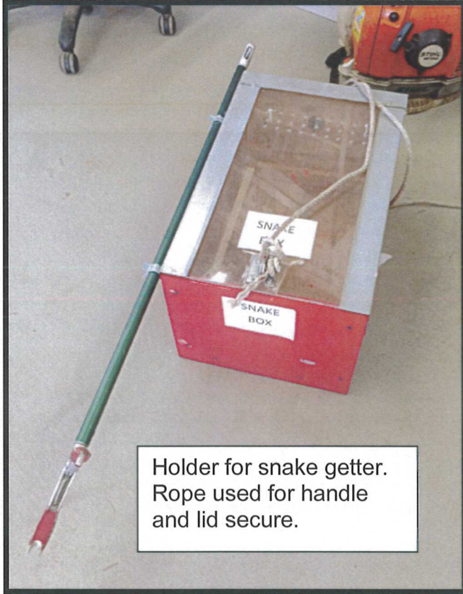
Holder for snake getter. Rope used for handle and lid secure.