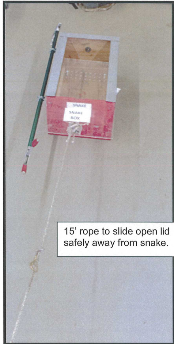
15' rope to slide open lid safely away from snake.