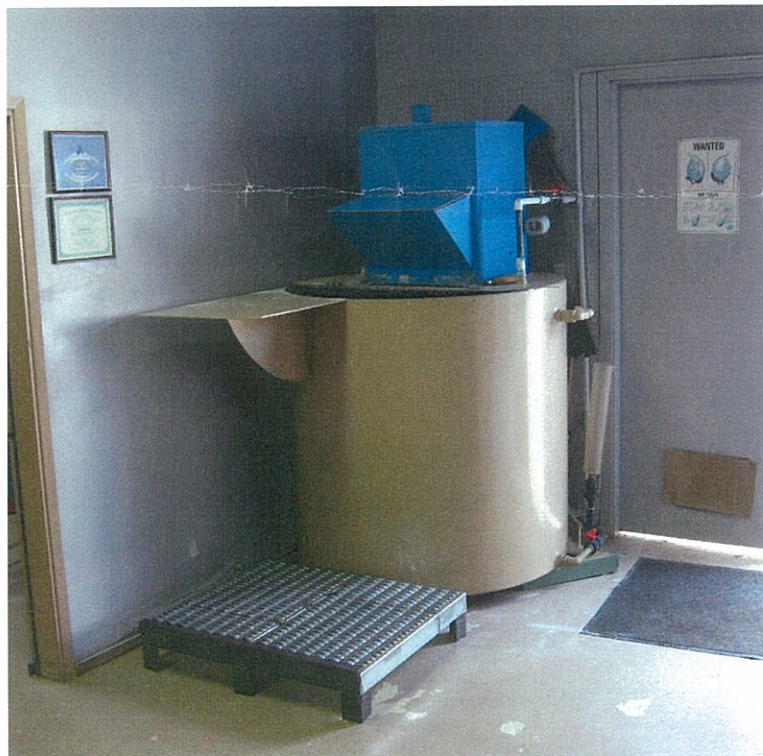
New Work Platform and Bag Support Surface